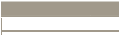
240 x 55 x h72 cm