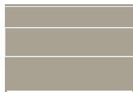
100 x 55 x h67,5 cm